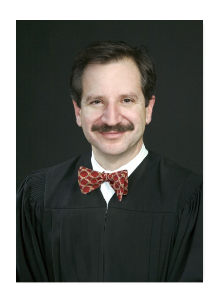
MAGISTRATE JUDGE Joseph C. Spero

Magistrate Judge Joseph C. Spero was appointed in 1999 and has presided as a trial judge in criminal and civil cases in a variety of subject areas, including patent, employment, civil rights, commercial contract, trademark, and federal misdemeanor cases. He has also served as a settlement judge in over 1500 cases.